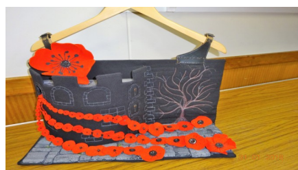
Some quilts from our Show and Tell